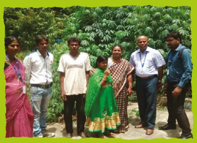
Reunification of a child with family by team through CWC

The programme has initiated quarterly follow up of reunified children. As a result, information of 585 children are being captured. During the follow up process 541 children were found to be staying back with families. Among them, 364 children were continuing education through formal schools. 22 children were engaged in vocational trainings and 47 were engaged in some sort of work with in the villages. 108 children were idle at home and the remaining 44 children have left home again due to the unstable socio-economic conditions of the family and the ignorant parents.