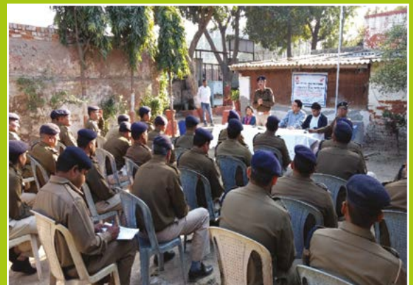
Capacity Building Training for RPF at Kishanganj Railway station

In Delhi, Railway Children India conducted capacity building training programs at nine Railway Stations of Northern Railway Zone. These trainings were conducted between 21st February to 28th March 2017 for Railway Protection Force (RPF). Total of 334 stakeholders including 227 personnel from Railway Protection Forces (RPF), Inspector-in-Charge of RPF, Assistant Security Commissioner (ASC)-RPF attended these capacity building programme. The contents of the capacity building programs were child rights, Child protection mechanisms and related laws, Standard Operating Procedures (SOP) for the Railways to ensure care and protection of Children in contact with Indian Railways.