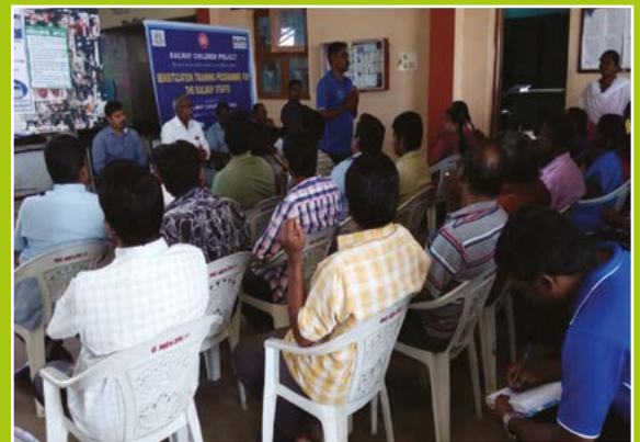
Stakeholders Sensitization Meeting at Villupuram Junction

In Tamil Nadu, 304 Railway Protection Force (RPF) and Government Railway Police (GRP) personnel were trained on Child Rights, Juvenile Justice Act, Standard Operating procedure (SOP) issued by Railways, and Protection of Children from Sexual Offences (POCSO) Act by Railway Children India at Chennai and Trichy division covering Chennai, Katpadi, Villupuram railway junctions. As a result children are being identified and referred to the Katpadi and Villupuram intervention for further processes.