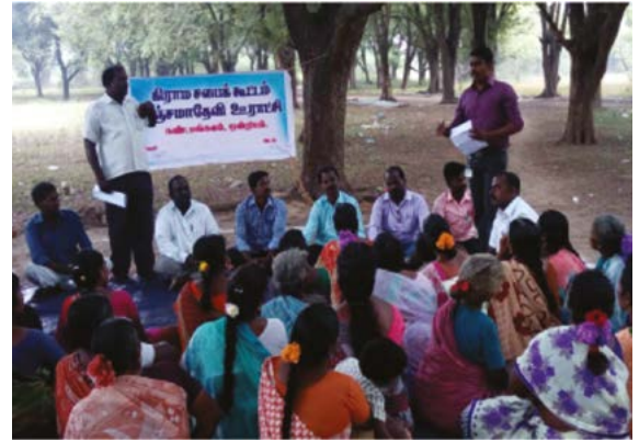
Child protection issues were discussed in Gram Shaba Meeting

In Villupuram district of Tamil Nadu, the members of the Village Level Child protection Committee (VLCPC) were oriented and sensitized on child rights and child protection by Railway Children India. After these orientation programs, VLCPC have started playing a significant role in ensuring care and protection children in the intervention sites. During this period VLCPC have supported 3 children who had taken up work after failing in their class 10th examination. VLCPC motivated them to give up their work and get back to schooling and with special tutorial support from the project they have now re-appeared for the class 10th examination and the results are awaited.