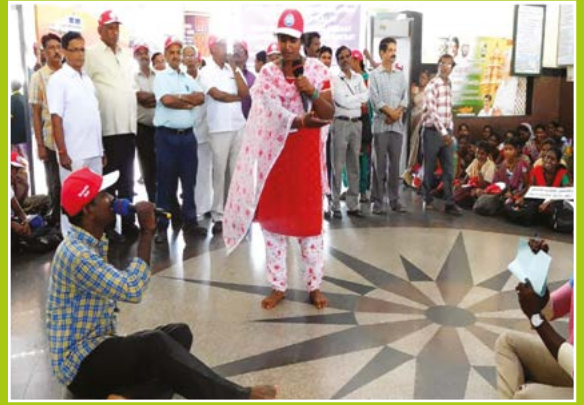
Awareness campaign through street play at Railway junction, Villupuram

In Tamil Nadu, 8 awareness meetings were organised at Villupuram and Katpadi railway station with the support of Child Help Group (CHG) to create awareness on the issues of children living alone and at risky situation to passengers. These awareness meetings were carried in the form of street theatres, song & dance and talk. Approximately 5500 passengers have been reached during this financial year. In addition to this, awareness handouts and display boards have been developed in consultation with railways are being used to reach out huge volume of passengers.