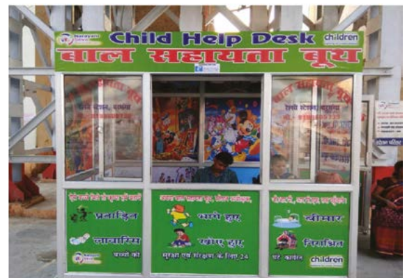
Child Help Desk at Darbhanga Railway station in Bihar

Child Help Desk at Darbhanga - Railway children India established Child Help Desk at Darbhanga Railway Station which is acting as nodal point of operation for outreach and child protection. It is manned with adequate human resources having requisite skill to outreach children immediately and can cater to their immediate needs like food, health check, counselling and connecting the missing and lost child with parents. At CHD, first-hand information of all children 'outreached' is maintained and updated every day by ensuring General Dairy entry with Government Railway Police.