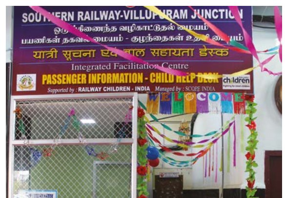
Child Help Desk at Villupuram in Tamil Nadu

Child Help Desk (CHD) at Villupuram: RCI started a model CHD at Villupuram railway station close to the main entrance and Platform 1 with a huge space of 13 X 10 Ft. It is designed as two separate space where at one place children are received and their information are collected. Another room is exclusively dedicated for children to settle, have safe space and supported with Psycho social needs. This space is created keeping the idea to make children happy when they step in and be there. A team of Bal Sabha members have designed this space. Structure and portraits were designed and developed by children themselves.