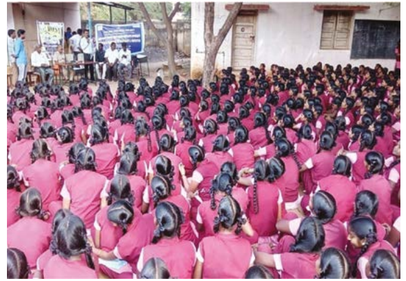
Child Rights Week - Sensitization programme at Govt. Higher Sec School, Villupuram

10 community members and volunteers from each village (Thennamadevi and Kappur villages) in Villupuram district were trained on child rights and role of community member in child protection. These volunteers managed and facilitated activities at the "Child Friendly Spaces". Through these centers "Bal Sabhas" were being formed and children were engaged. Initiatives have been taken to map specific needs of each child and their family through "Vulnerability Assessment Tool.